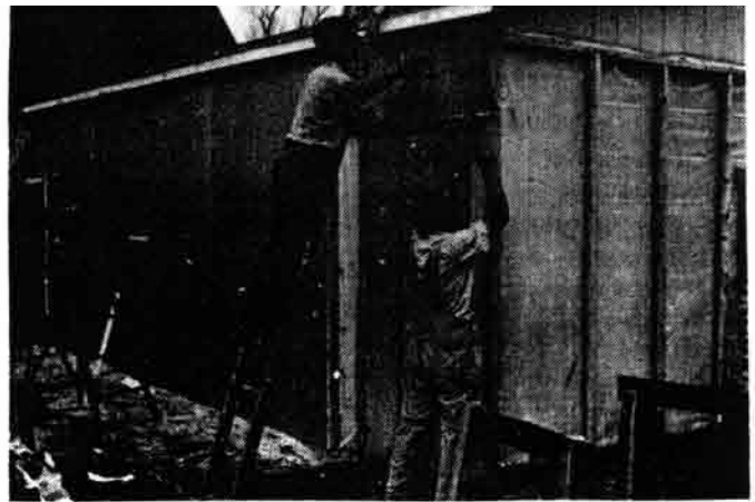
—Rob Aiken, left, assists Edgar Wuebben with insulation of his dairy barn. A vapor barrier was placed over the concrete block wall before mounting double 2 X 2's using concrete nails. Then fiberglass batt insulation and galvanized metal were installed. Fuel use for heating was cut in half.